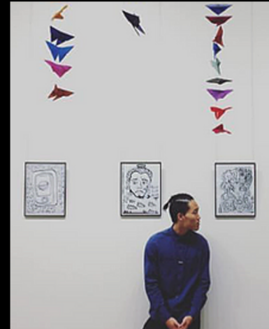
Marshall Islands: Bo Thai