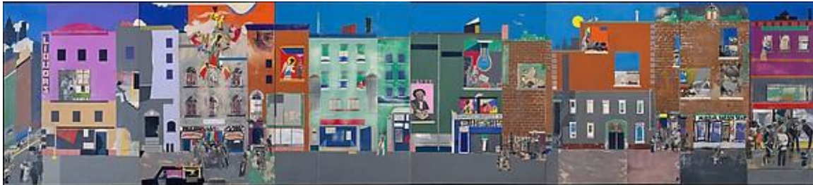
The Block, 1971

Romare Bearden was born in Charlotte North Carolina in 1911 by the time he was three his family moved to Harlem. His grandmother lived in Charlotte so he spent a lot of his summers in the area. He graduated from New York University with a degree in Mathematics.