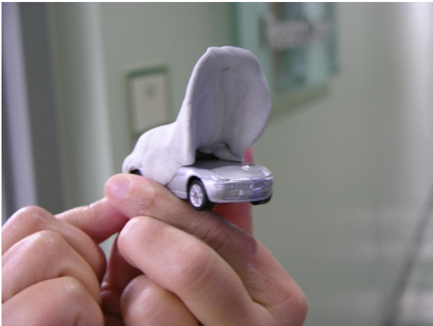
Figure 4. Car with standard clay load set up for high drag.