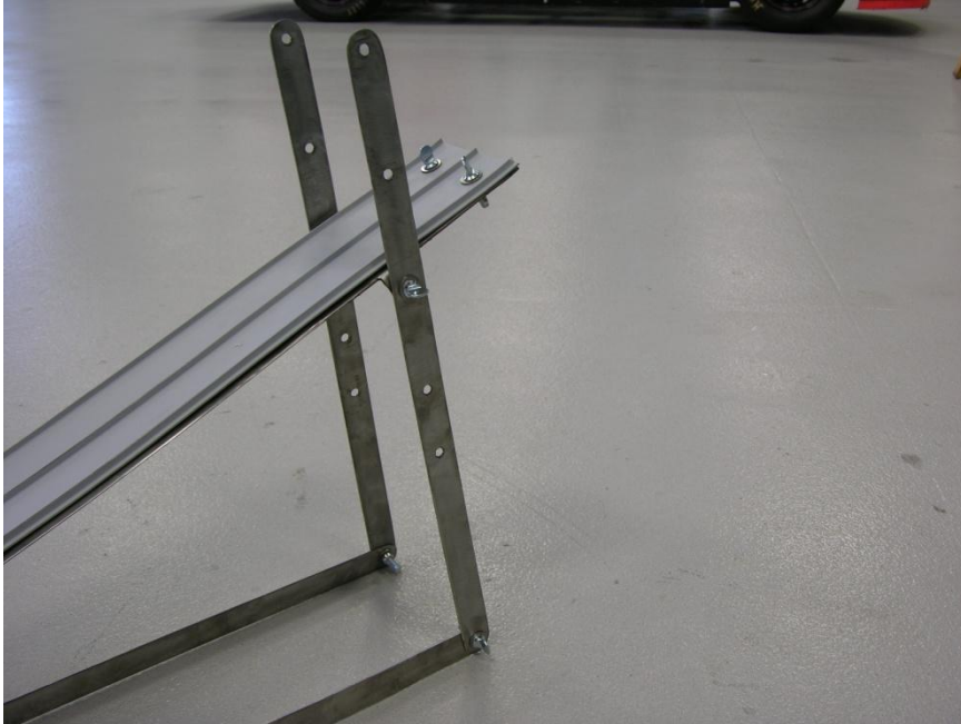
Figure 1. Adjustable height struts