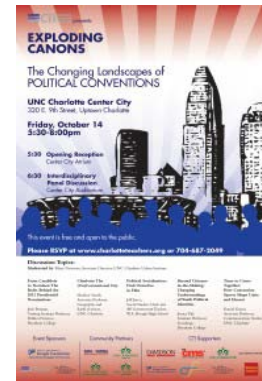
Exploding Canons: The Changing Landscapes of Political Conventions October 14, 2012